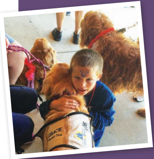
Paws & Think at Camp Healing Tree

The summer grief camp became a formal program that has been added to our menu of services. Camp Healing Tree and Brooke's Place have had a long-standing community partnership given our mutually shared missions of serving grieving children.