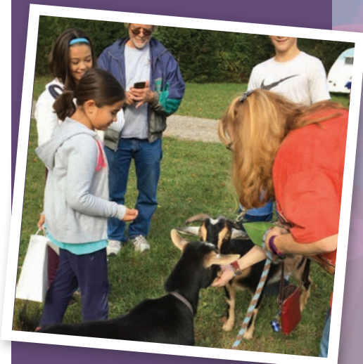
A fun family day on the farm at our Celebration of Healing